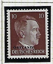
10 (Pfg) deep brown