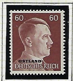
60 (Pfg) red-brown