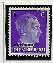
6 (Pfg) bluish violet