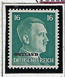
16 (Pfg) turquoise-green