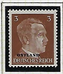
3 (Pfg) reddish brown