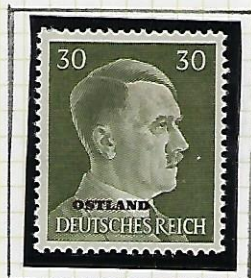
30 (Pfg) olive-green