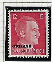
12 (Pfg) carmine (recess, iss. 1943)