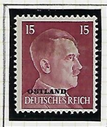
15 (Pfg) brown-lake