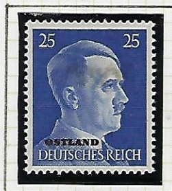
25 (Pfg) ultramarine