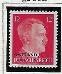
12 (Pfg) scarlet