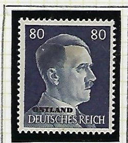
80 (Pfg) indigo

Designs by R.Klein. Printed typo except 10 and 12 (Pfg) Nos. II of 1943 printing in recess.