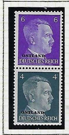
6 + 4 (Pfg) (Mi. S 3) * *