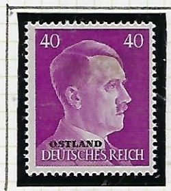
40 (Pfg) magenta