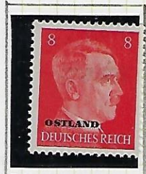
8 (Pfg) vermilion