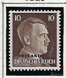
10 (Pfg) olive-brown (recess, iss. 1943)