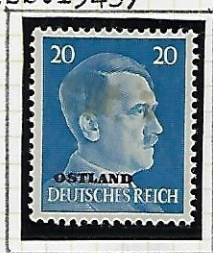
20 (Pfg) blue