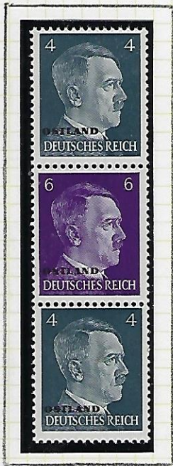
4 + 6 + 4 (Pfg) (Mi. S 2). * *