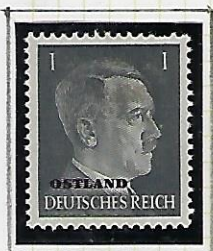
1 (Pfg) blackish grey

4 Nov. 1941: German Hitler Stamps of Issue 1 Aug. 1941 overprinted "OSTLAND".