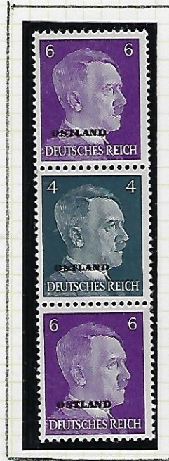
6 + 4 + 6 (Pfg) (Mi. S 4) * *