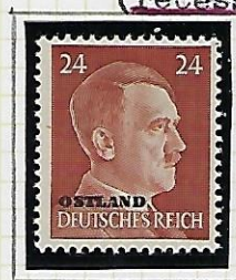
24 (Pfg) orange-brown