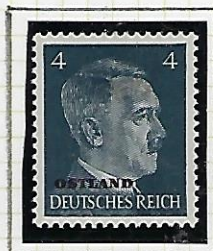
4 (Pfg) blackish grey-blue