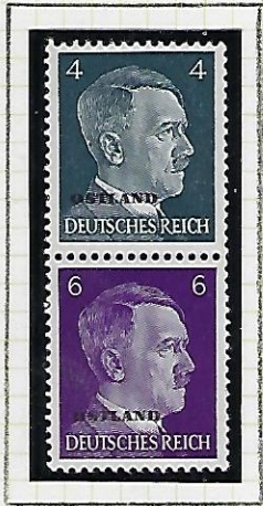
4 + 6 (Pfg) (Mi. S 1) * *

(b): 4 (Pfg) and 6 (Pfg) stamps printed together (from Coil Stamp Vending Machines).