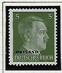
5 (Pfg) deep olive-green