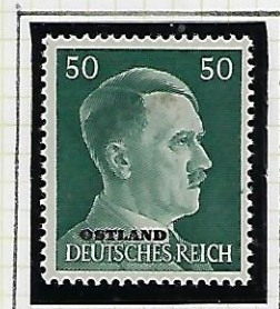
50 (Pfg) myrtle-green